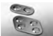
built-in buttons for 1 or 2 motors

Please select from our wide range of control elements on page 24