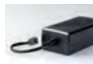
switching power supply