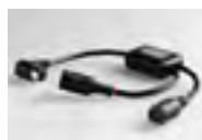
adapter for touch sensor