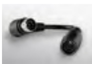
adapter for controls